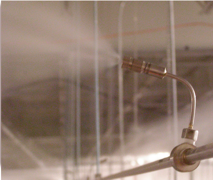
100,000 sq ft facility view of ceiling nozzles, header bracketing & ball valves